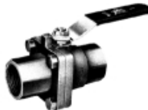
Ball valves with TFE seats and packing, adjustable packing box.