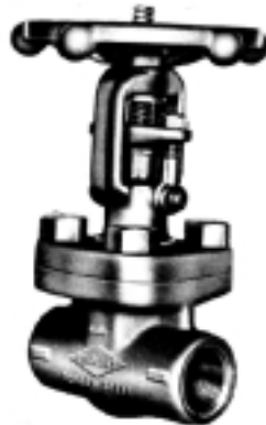
OS&Y gates. class 150, 300, 600 integrally forged flanged ends. Bolted Bonnet.