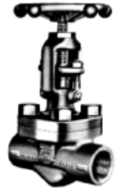
OS&Y gates, class 800 threaded, socket weld and female threaded for socket weld ends bolted bonnet.