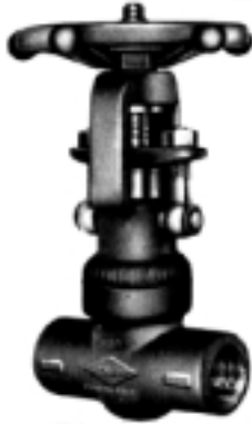
OS&Y gates. Threaded and socket weld ends 800 psi 850 degrees F. welded bonnet.