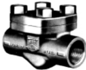
Lift check threaded and socket weld ends class 800 bolted cover