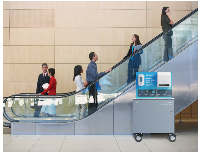
Convention Centers and Retail Environments