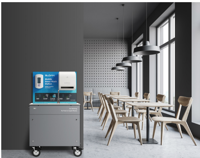
Cafeterias and Food Courts

We've created a customizable hygiene station on wheels that pairs attractive design with the durability you expect from Sloan. It's a simple solution that helps your facility enhance health, wellness, and hygiene.