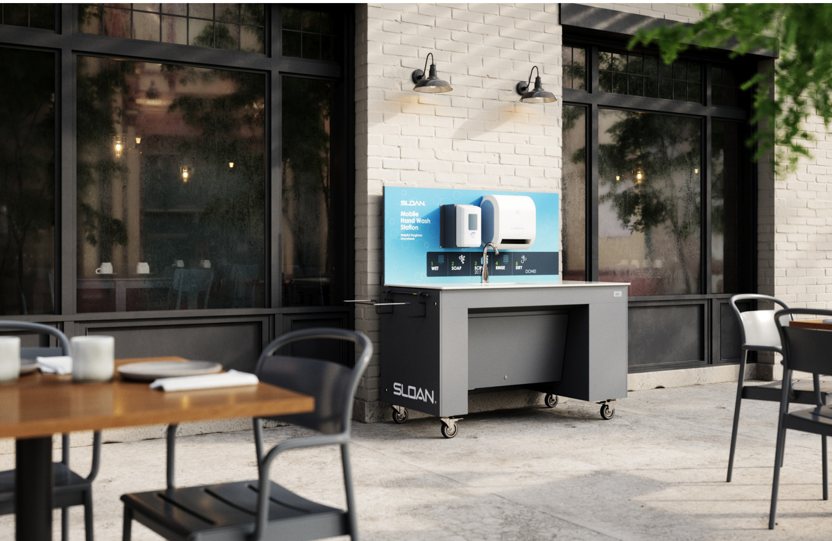
MH-4000-ADA Mobile Handwashing Station in outdoor setting.