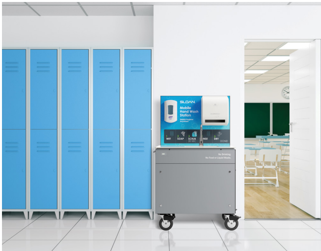
Universities and Schools