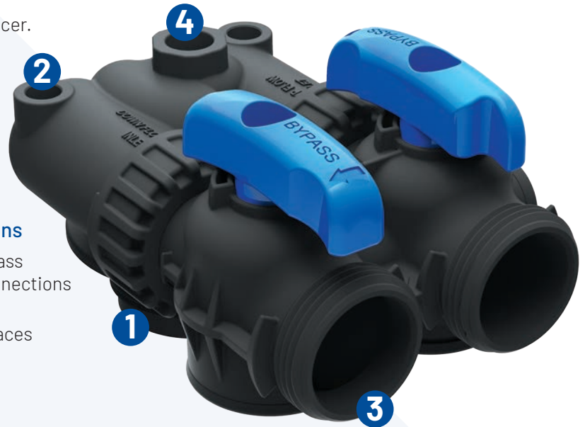
*Image above shown assembled with bypass. Bypass sold separately.