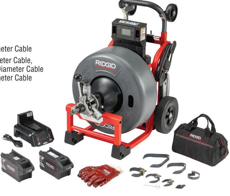
*Drum includes 5/8" or 3/4" Pigtail. Cable sold separately.

• Dimensions (Handle Down) ......37" x 22" x 35" (940mm x 559mm x 889mm)